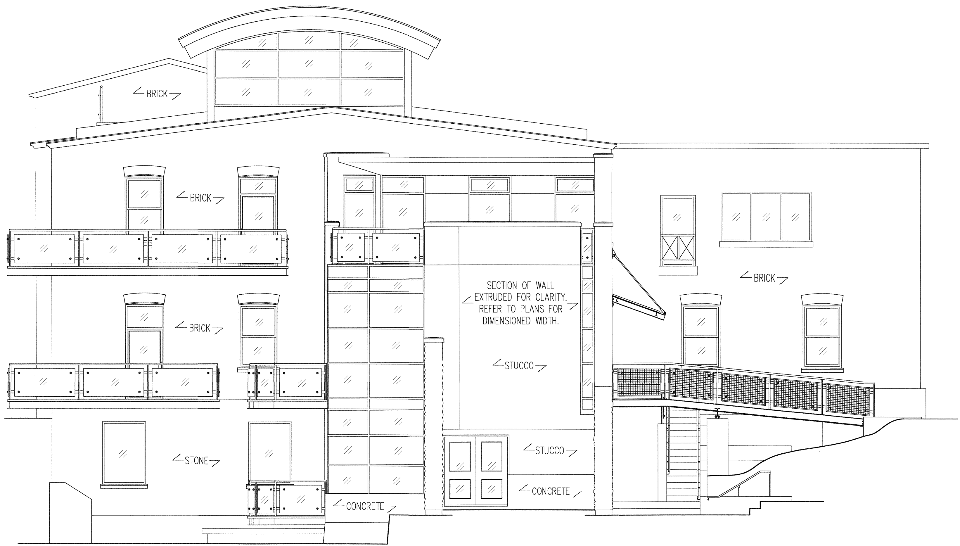
1 SOUTH ELEVATION SCALE 3/16" = 1'-0"